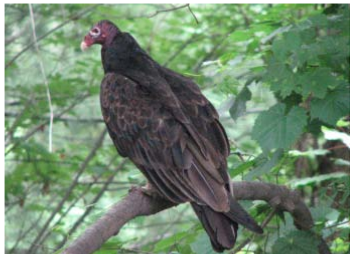
A turkey vulture photographed just before attacking a squirrel in a Richmond Hill back yard this summer. Photo by Bob King, July 19 2012

Two squirrels had been foraging there moments earlier. The next day the Kings found a "fresh" squirrel skull in the yard.