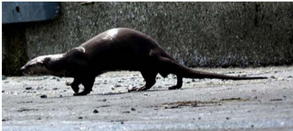
River Otter seen at Cattle Point, Vancouver Island, above and Allan's Hummingbird, below. Photos by Theo Hofmann, May 2012

At Witty's Lagoon *Homo sapiens* dominated. All the same we had four *Common Mergansers*, and a few *White-winged Scoters* and *Western Grebes* out in the ocean. A *Bald Eagle* flew over. At nearby Witty's Beach, we observed a very active *Belted Kingfisher* and a pair of *Gadwall*, and the ubiquitous *North-western Crow*. Next at