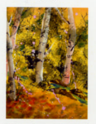
Watercolours • Acrylics